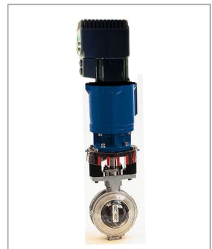
MAC800 with Module MAC00-P5 for control of industrial valve