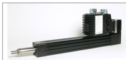
MAC800 with Module MAC00-P5 on linear guide for fuel injection control system